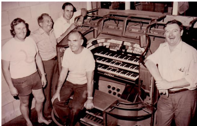
Figure 1: The organ back in 1982