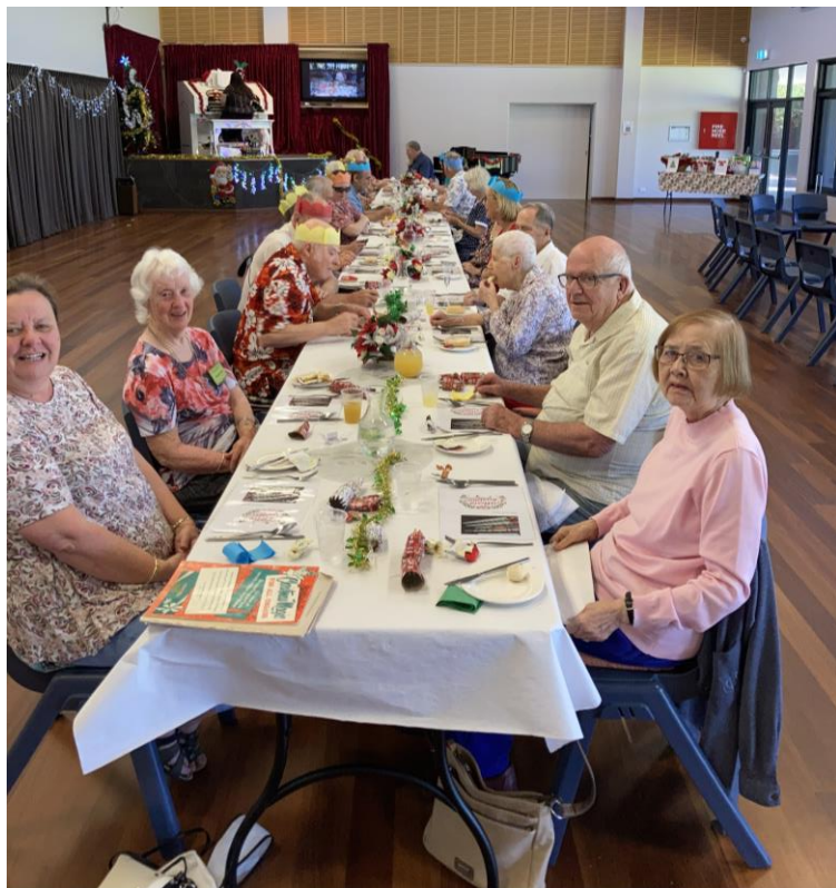
Christmas Luncheon, December 2021